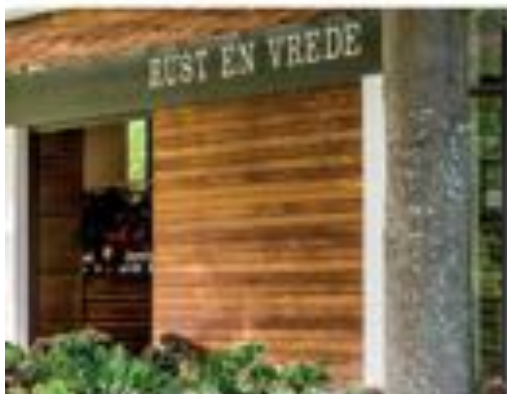
RUST EN VREDE